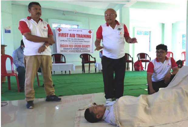
Imphal, July 6

Indian Red Cross Society (IRCS), Bishnupur Branch today organised training on first aid at Panchayat Resource Centre, Mini Secretariat com-